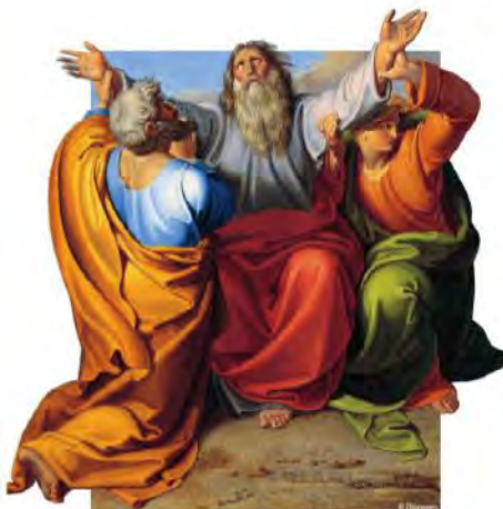
When the Son of Man comes, will he find faith on earth?

Tuesday.....5:30-5:45 pm First Friday.....6:30 am Saturday .....3:00-3:30 pm