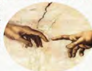
Michaelangelo - The Creation of Adam

"With all humility and gentleness, with patience, bearing with one another through love, striving to preserve the unity of the spirit through the bond of peace: one body and one Spirit, as you were also called to the one hope of your call; one Lord, one faith, one baptism; one God and Father of all, who is over all and through all and in all." (Ephesians 4:2-6)